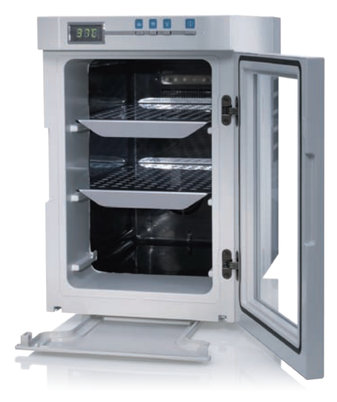
Heratherm Compact microbiological incubator, 18 L