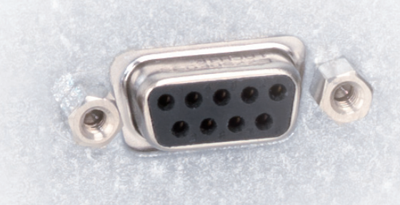
RS232 standard on all General Protocol, Advanced Protocol and Advanced Protocol Security models/sizes

Heratherm incubators offer exceptional data monitoring systems that provide the key to reliable results.