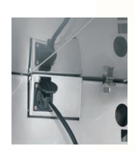
Heratherm Advanced Protocol incubators with internal socket for connection of electrical device (e.g. stirrer / shaker)