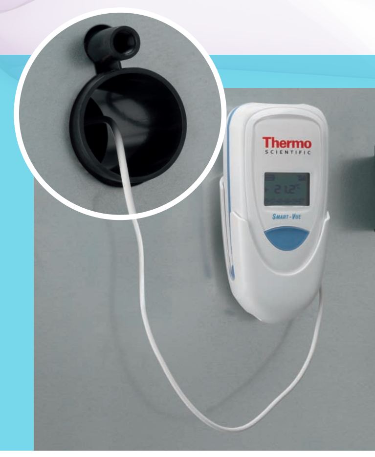
Rear view of the 100 L Advanced Protocol incubator with Smart-Vue

Solutions vary by RF regions worldwide and are compatible with multiple brands and types of laboratory equipment. Contact your local sales representative for more details.