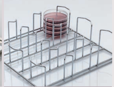
Petri dish holder