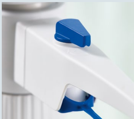
New! Perfected recirculation valve lever for easy setting of recirculation or dispensing position