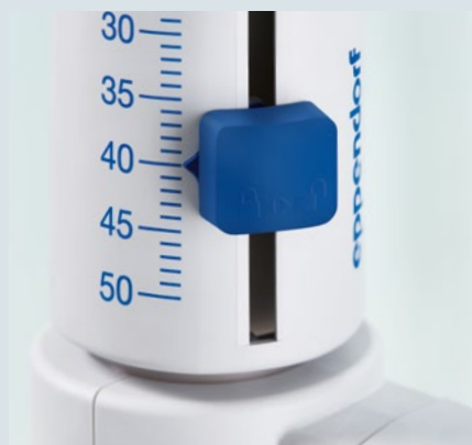
New! Ergonomically designed slide for smooth volume adjustment and fixation