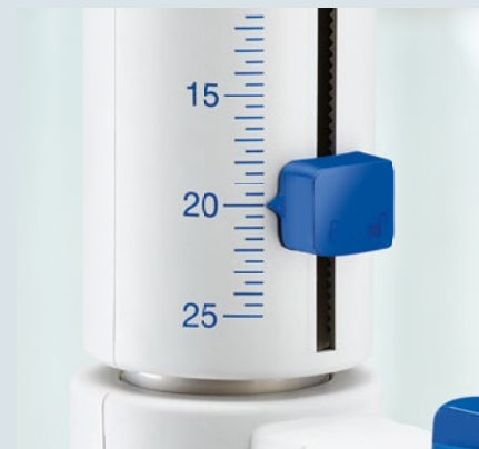
New! Optimized volume scale for clear visibility and precise volume adjustment