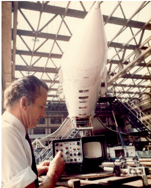
CONCORDE program UK-1960s

Ultrasonic Non-Destructive Testing (NDT) has helped engineers inspect all sorts of composite materials for years. Whether it be traditional aluminum laminates or today's more complex carbon fibre-based composites, ultrasonic NDT technology has the ability to acoustically see through these parts and create complete inspection maps. Comprehensive volumetric integrity reports can be generated and supported by imaging reports that are as easy to interpret as traditional X-Ray.